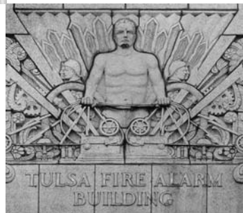
Tulsa Fire Alarm Building (1931)