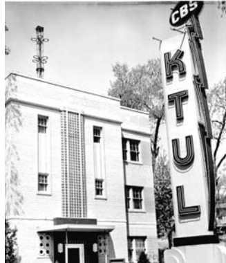
KTUL Station (circa 1950)

The Tulsa Foundation for Architecture is a resource that recognizes, records, and encourages preservation of the built environment and advocates future development that enhances Tulsa's livability.